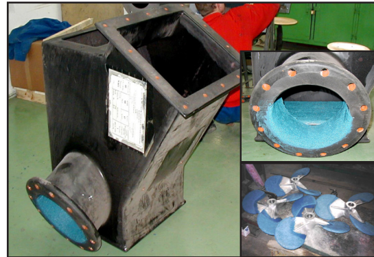
New chutes and mixer blades lined and coated with ARC MX1